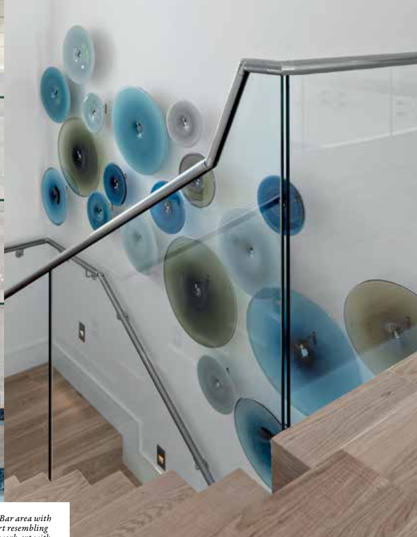
Clockwise: Bar area with abstract art resembling coral; glasswork art with colours to match the ocean; bedroom with easy access to the sand and sea.