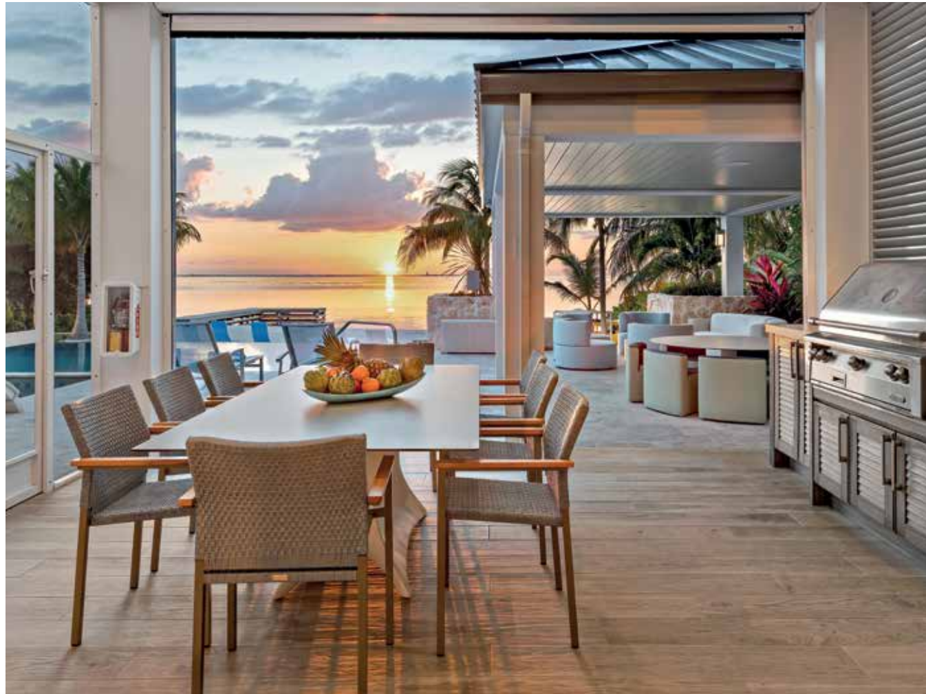
Al fresco dining is a delight.

“WE’VE RECEIVED SO MANY COMPLIMENTS ON THE HOME, AND IT’S VALIDATING THAT THIS WASN’T (SUCH) A CRAZY IDEA AFTER ALL. WE DID IT.”