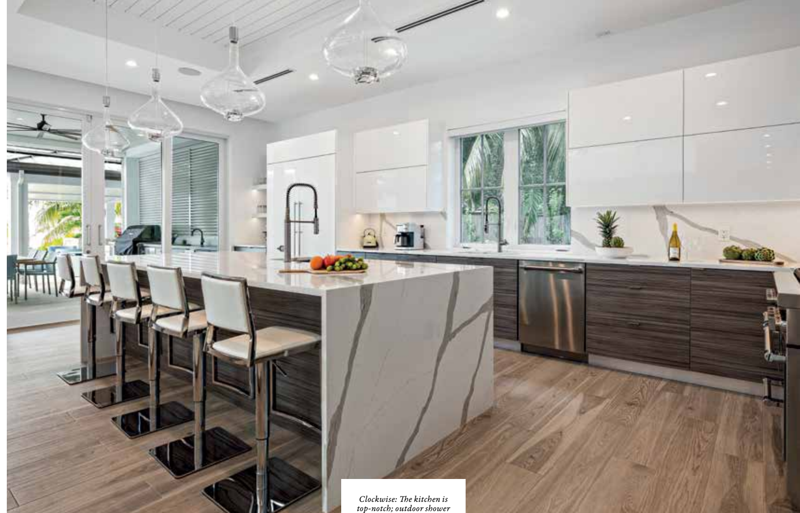
Clockwise: The kitchen is top-notch; outdoor shower made from local stone; vanity basin.

Following the delays caused by the pandemic, such as supply chain issues and labour shortage, the house was finished in December 2022.