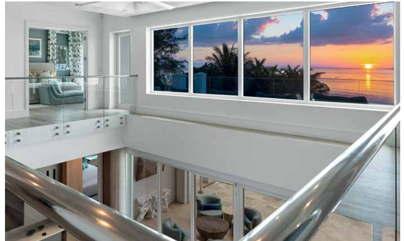
Mezzanine landing allows views to the sea.