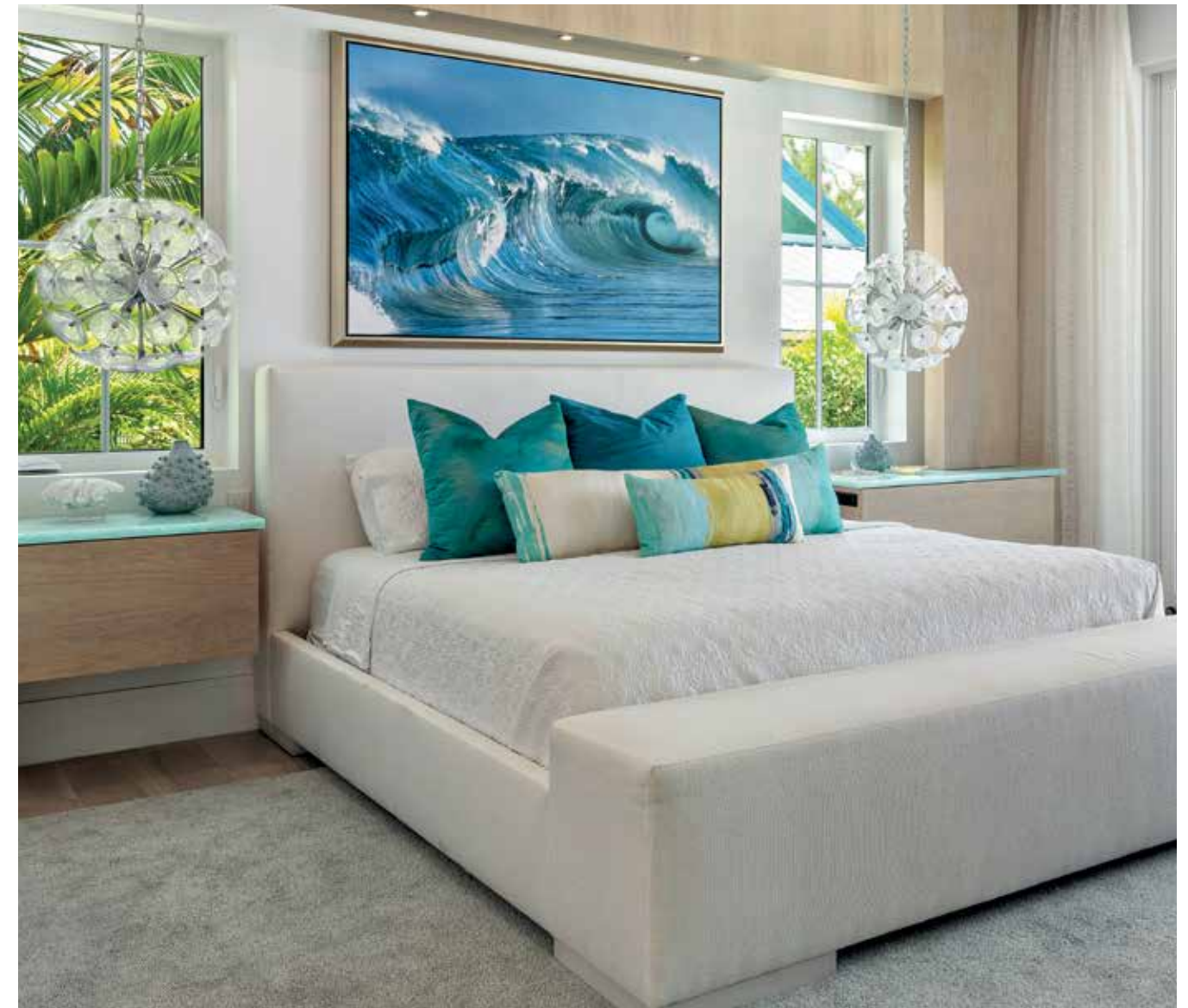
Above: Statement-piece bathtub. Left: Sleeping surrounded by tropical foliage and waves.