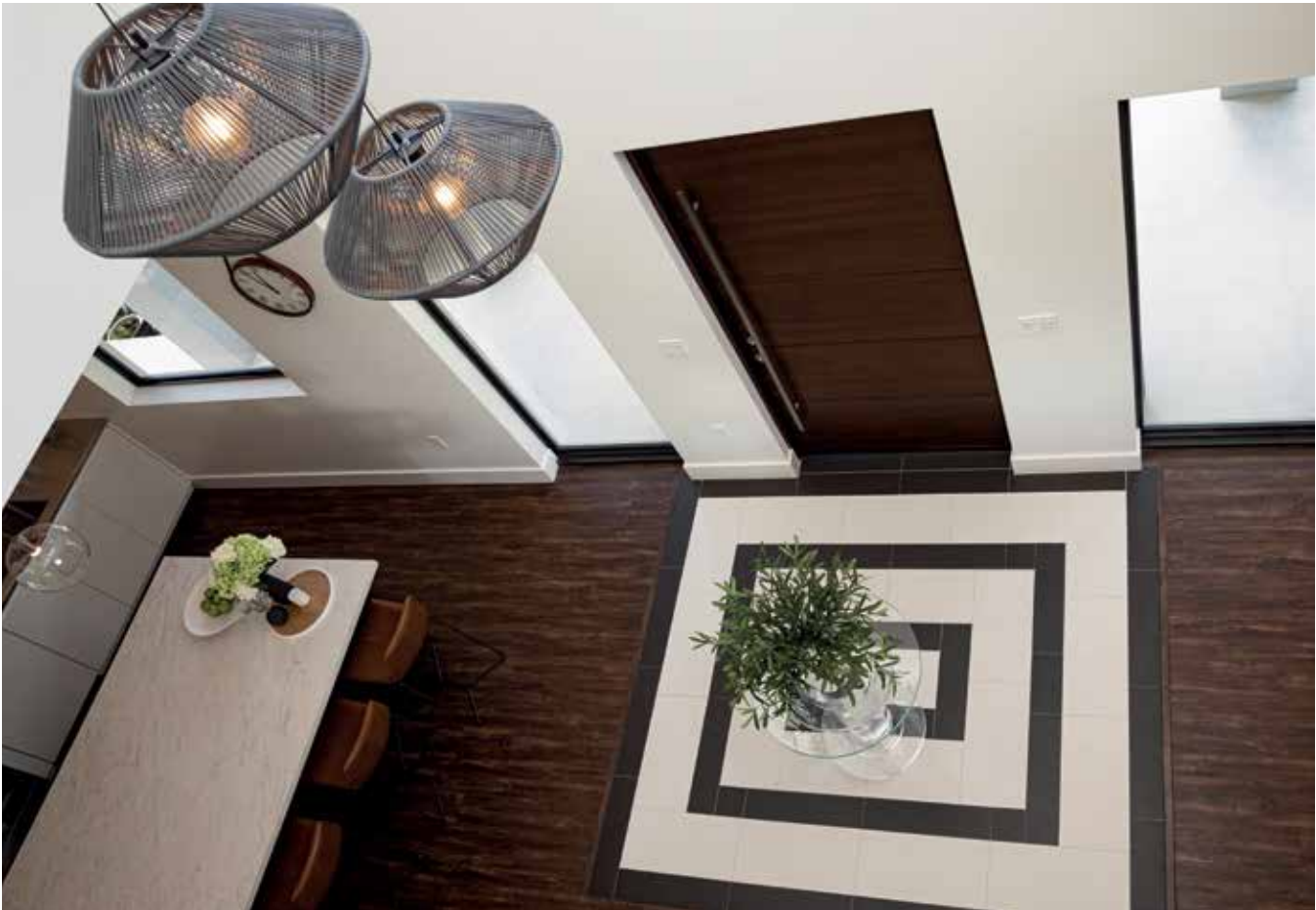
Left: Powder room with custom-made tile. Above: Elegant entranceway.