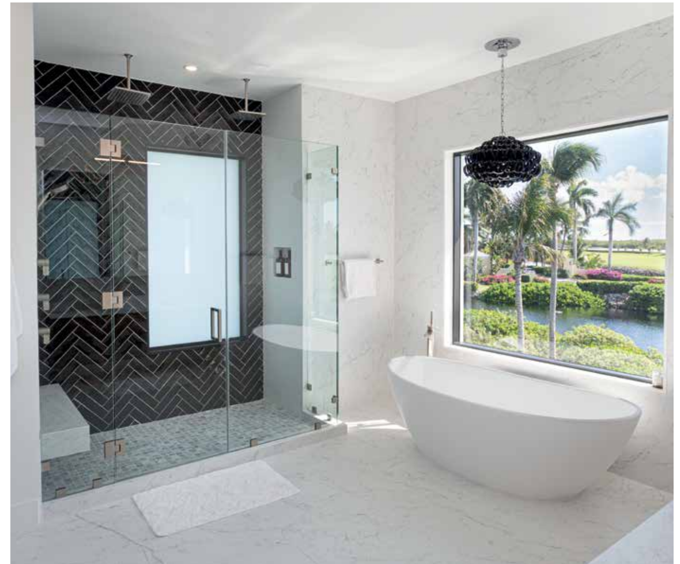
The master bathroom.

THE HOME HAS INFLUENCES FROM MID-CENTURY MODERN DESIGN AND THE BEAUTIFUL ART DECO HOTELS OF SOUTH BEACH, IN PARTICULAR THE NEARBY RALEIGH HOTEL.