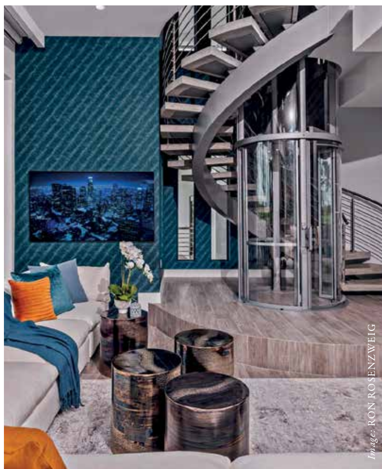
Above: Step-down TV lounge with modern stainless steel circular elevator and concrete stairs to first floor; Right: Square dining table for eight, back-lit wine cabinet and unique art pieces.

The couple bought the house lot in 2018 after considering other locations as far afield as Southeast Asia, Central America and the Mediterranean. They decided Grand Cayman was by far the best place, initially for a vacation home but with a view to eventually settling on the island.