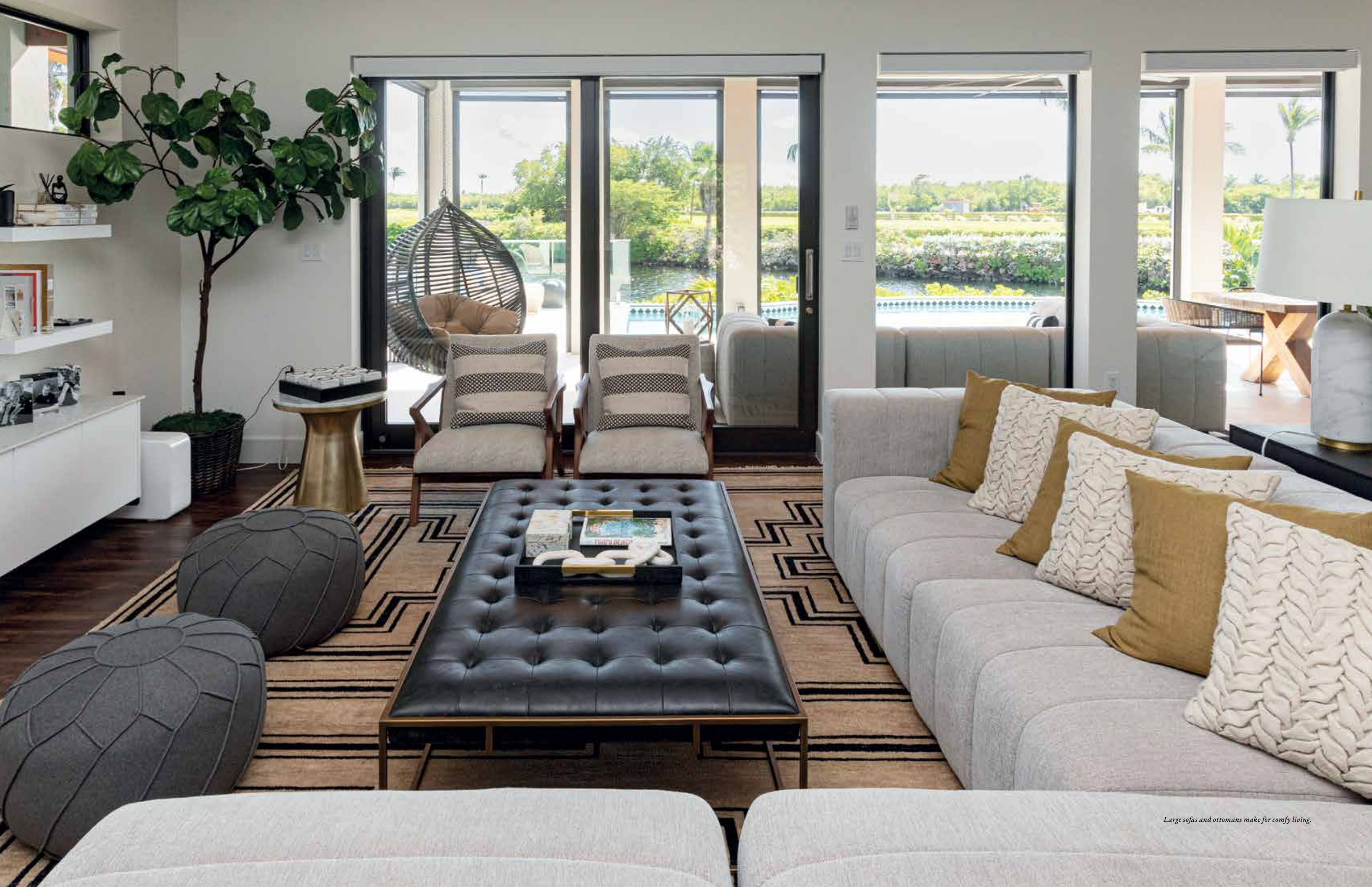
Large sofas and ottomans make for comfy living.