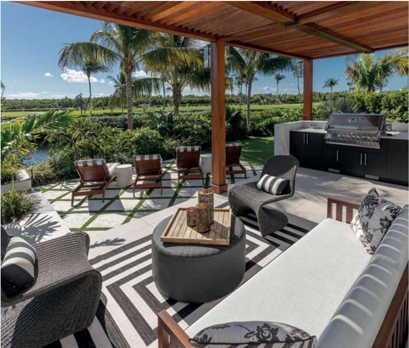
Wide verandas lend themselves to outdoor living.