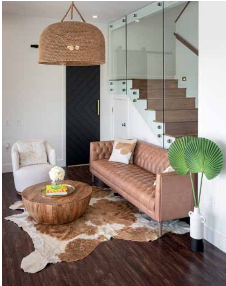
Above: Neutral tones. Right: The kitchen.