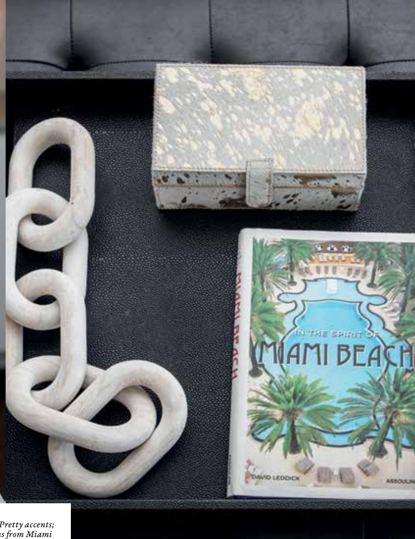
Clockwise: Pretty accents; inspirations from Miami Beach; Victorian-era tile; lounge chair.