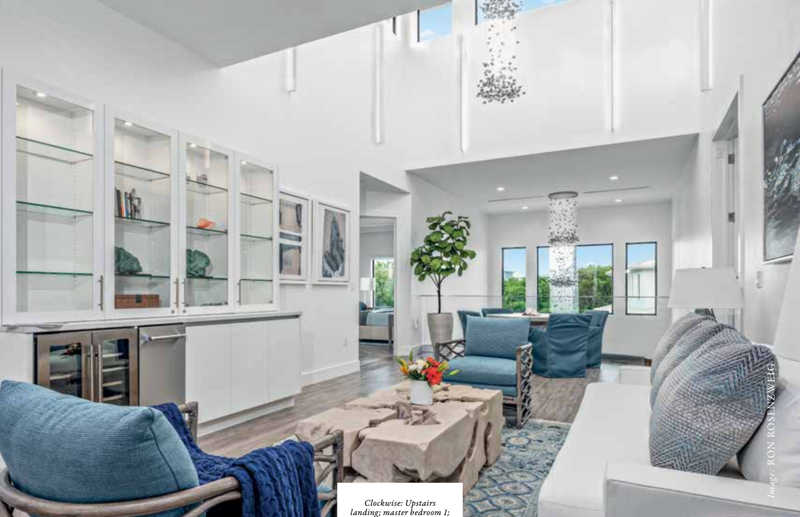
Clockwise: Upstairs landing; master bedroom 1; pedestrian access to front door.