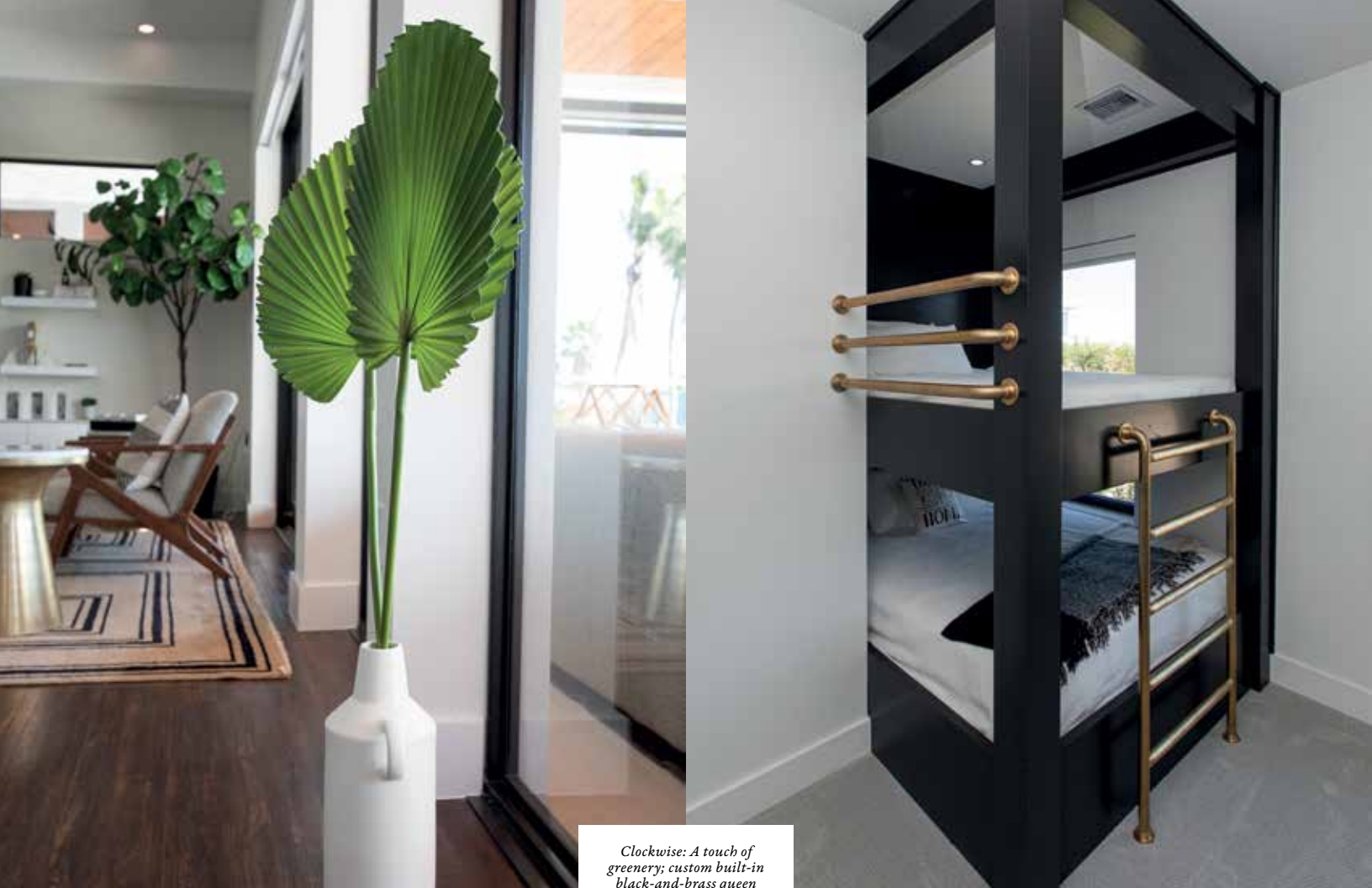
Clockwise: A touch of greenery; custom built-in black-and-brass queen bunk beds; master bath; pool loungers, South Beach-style.