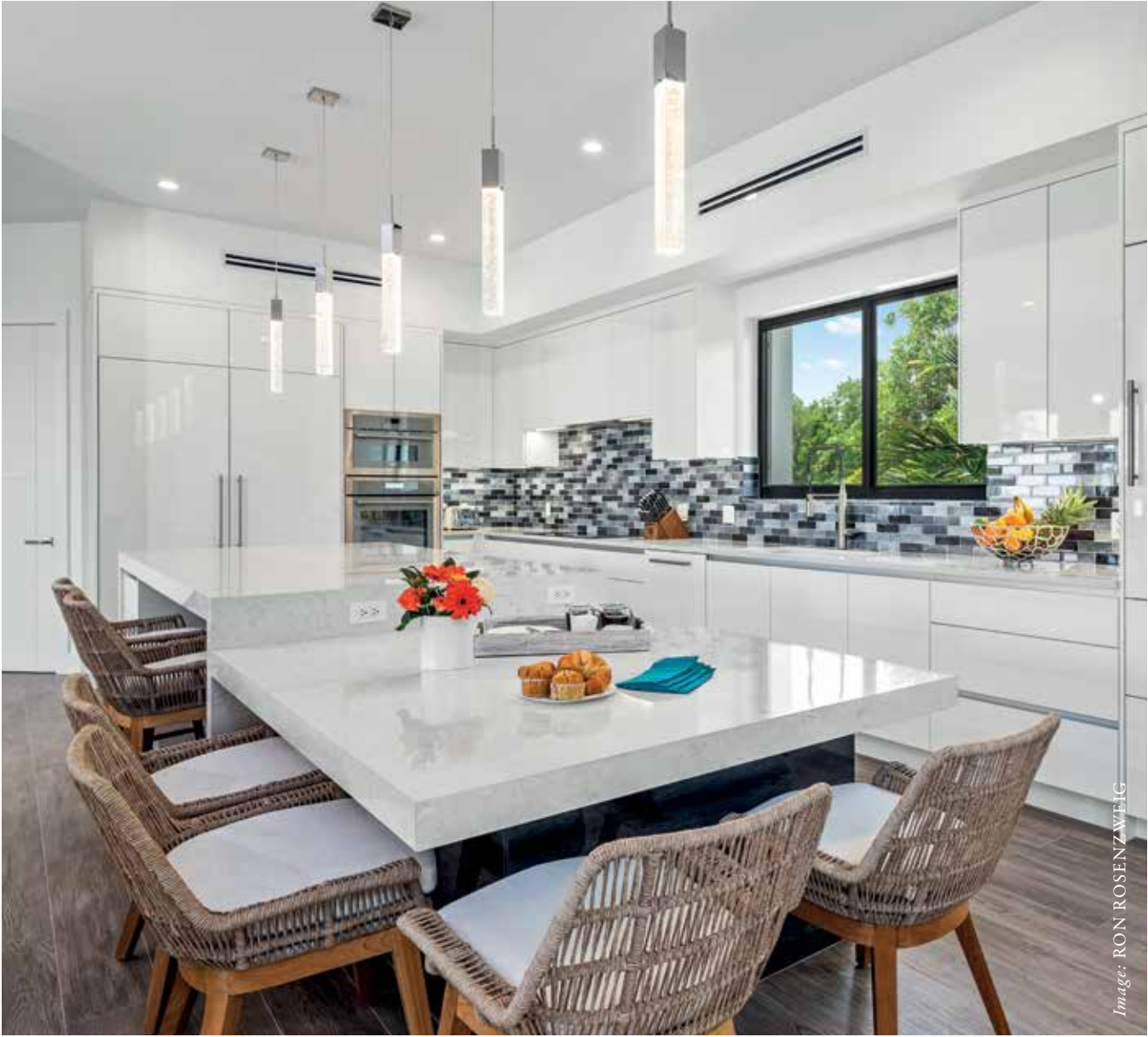
Fully equipped and built-in kitchen area, including butler's pantry.

“BABAZEKA IS A ZULU WORD MEANING ‘TO BE BEAUTIFUL’. ... IT IS FUN TO PRONOUNCE AND ALSO ADDS A LITTLE BIT OF MYSTERY.”