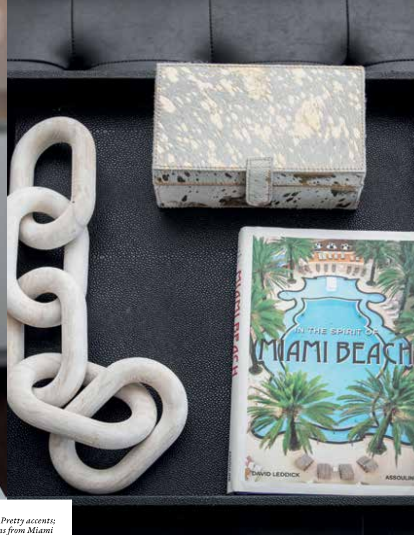
Clockwise: Pretty accents; inspirations from Miami Beach; Victorian-era tile; lounge chair.