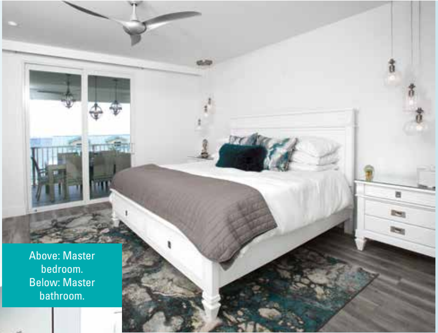
Above: Master bedroom. Below: Master bathroom.