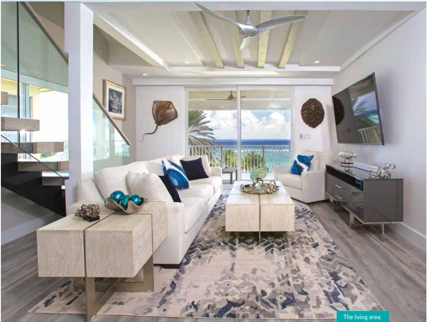
The living area.

driftwood-esque flooring,” Tracey points out.